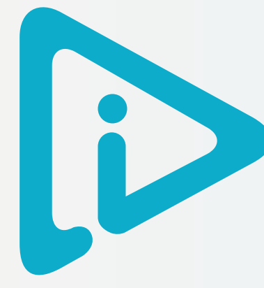
AdChoices Icon impact on OBA Favourability Top 5 Results

Based on these findings, we encourage publishers to adopt the AdChoices Icon on their websites as a vehicle to inform their viewers that third party advertising may be happening across their platforms.